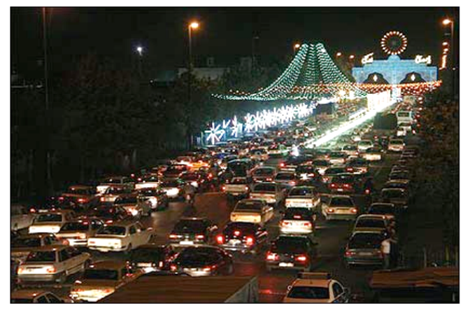
Tehran was lit up on the eve of the birthday of the 12th Imam, known as the Mahdi. He is said to have gone missing in the 10th Century but is expected to return.

The belief, which helped to inspire Iran's Islamic Revolution 27 years ago, diminished in importance over the years. Till most recently.